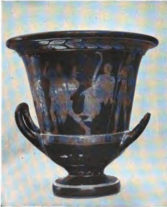
Fig. 82. Cadmus and the Dragon.

the spring. There lay the bloody and mangled bodies of his companions, and over them threatened the huge triple jaws and three-forked